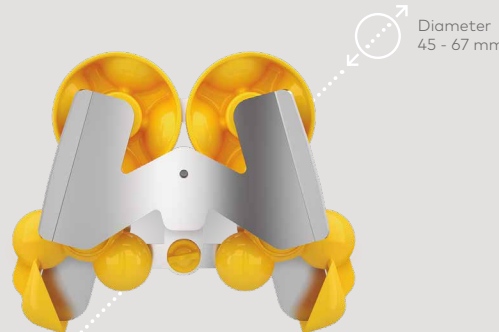
1Step S Extraction Kit