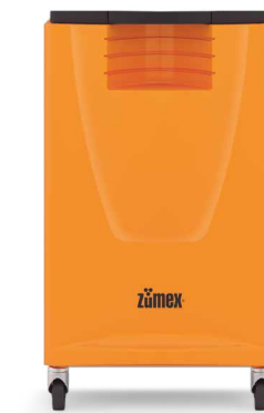
Podium Versatile Pro

Create your healthy and refreshing spot at your hotel, convenience store, service station or supermarket, and start to enjoy a service that adapts to you.